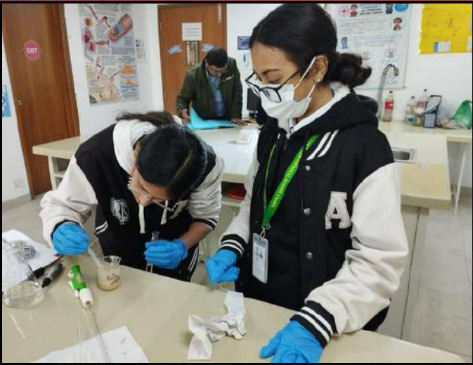
Squeezing yeast into a dropper