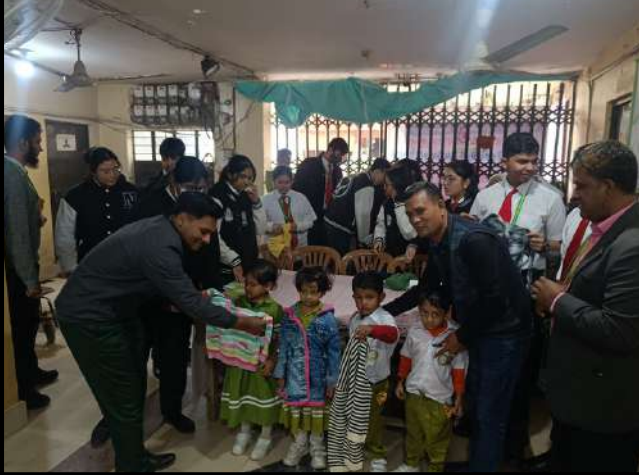
DP Year 1 students spreading some warmth and happiness