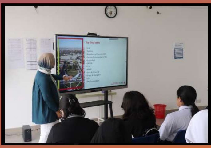
Students learn about what York University has to offer