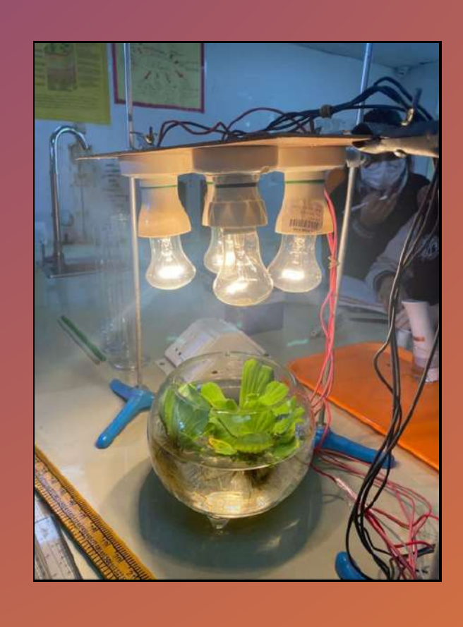
Students measuring the Dissolved Oxygen levels in the sample