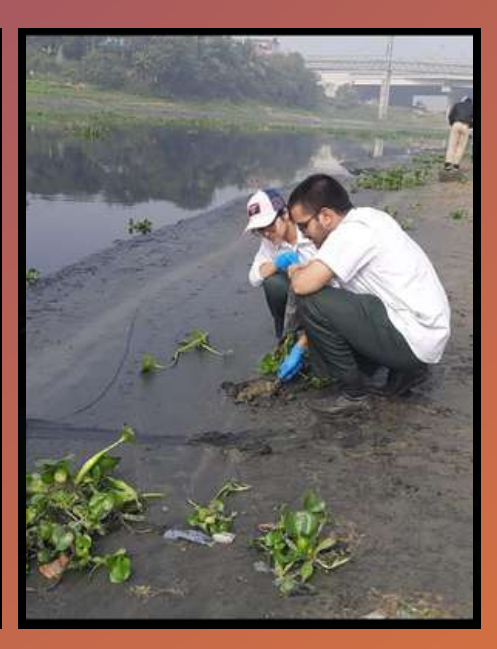
DP Year 2 Students conducting their Group 4 Project