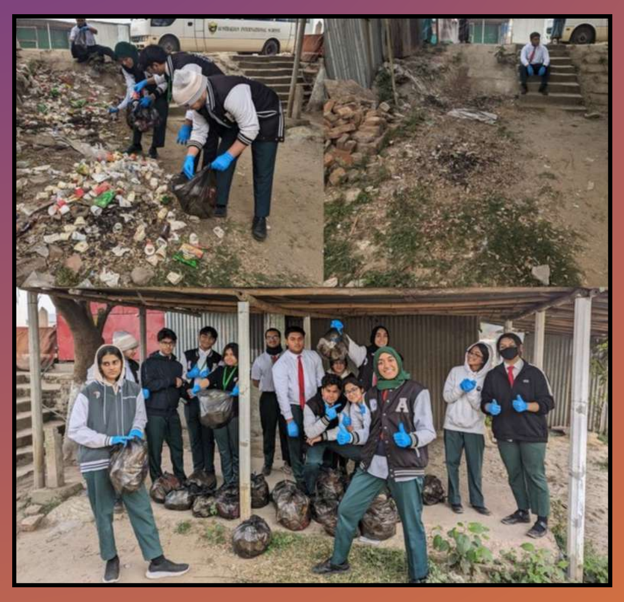
The DP Year 2 Students clean up as part of CAS

Our DP Year 2 students excelled in their CAS service activity by conducting a community clean-up. This hands-on experience not only meets CAS requirements but also teaches students the values of diligence, environmental responsibility, and collaborative engagement. Through teamwork and commitment, the DP Year 2 students transformed public spaces, leaving a positive impact on the environment. This experience leaves a sense of accomplishment, serving as an inspiring example that individual actions drive positive change.