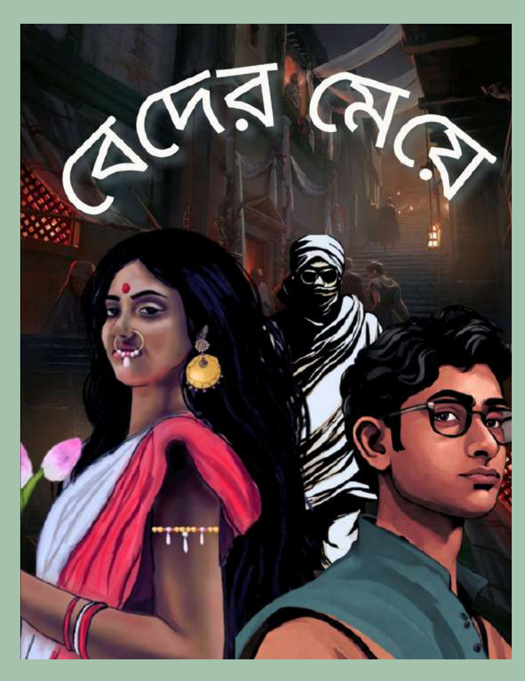
Poster for 'Beder Meye' by Samara Haque DP-1

Bangla literature is filled with remarkable characters, and in order to celebrate them, DP 1 students have embarked on a journey to bring them to life through the medium of movie posters! The students utilized their artistic skills, combining graphic design with their creativity and interpretation of these characters. They delved into these characters, the stories and the themes present. They translated their insights into visually captivating and thought-provoking posters.