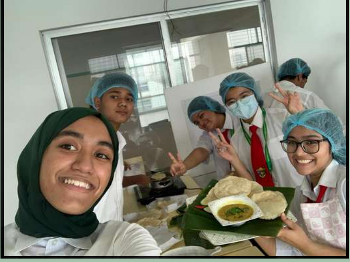
Students With Their Stalls