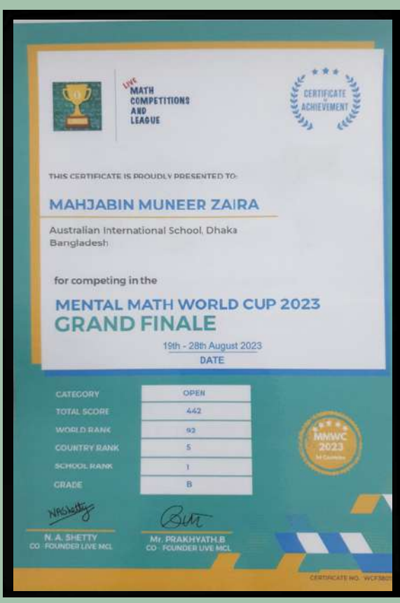
Awards For The Mental Math World Cup